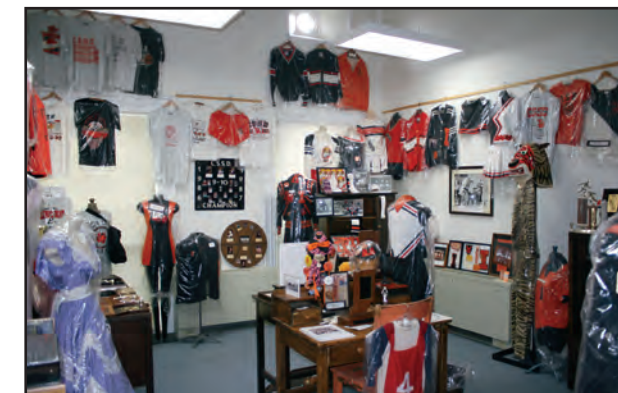
The Cheerleaders Room