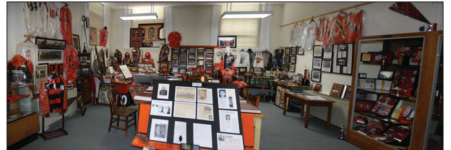
The Sports Room