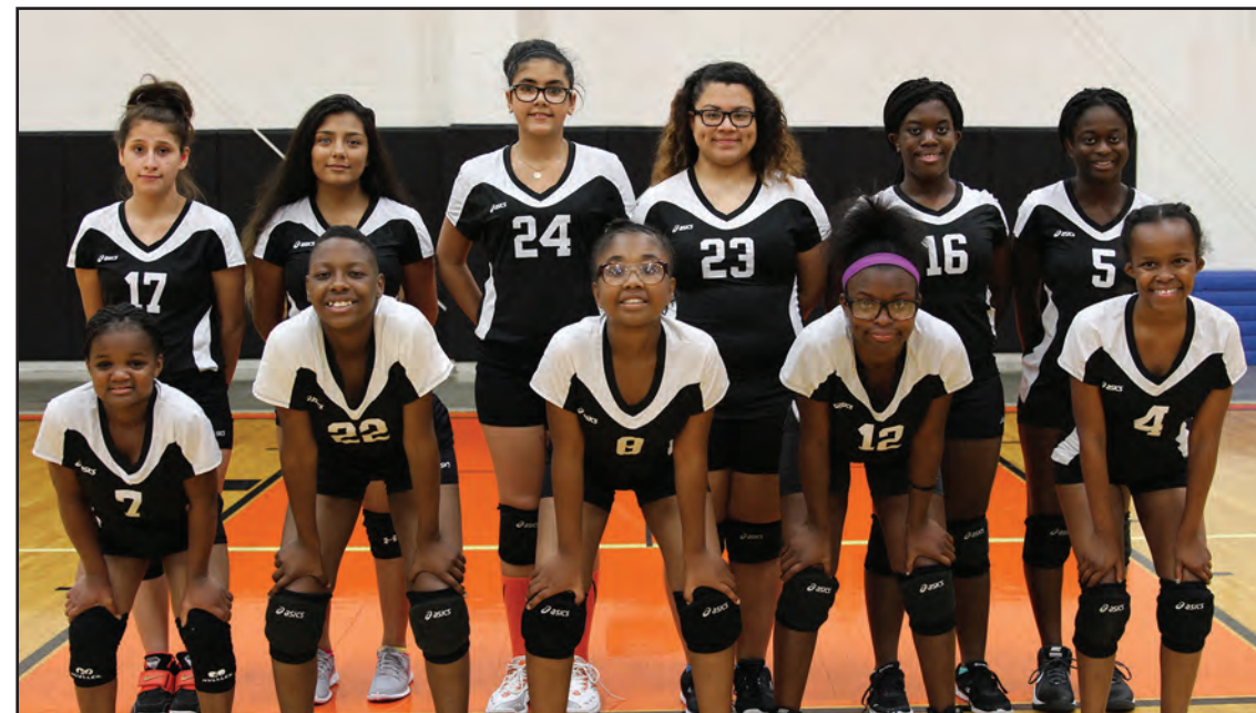
Junior Varsity Team