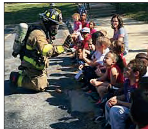
The Jacksonville Fire Department came to visit in October and taught us about fire safety and prevention!