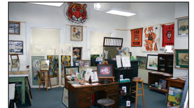
The Art Room