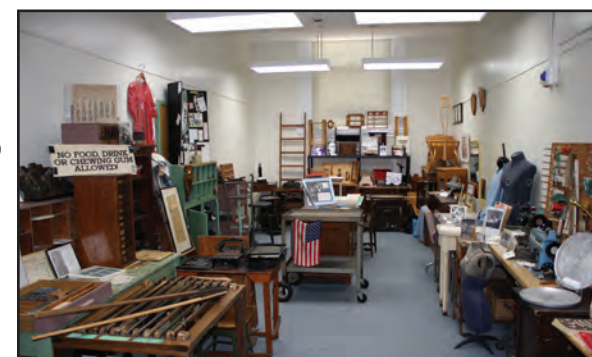
The Vocational Education Room